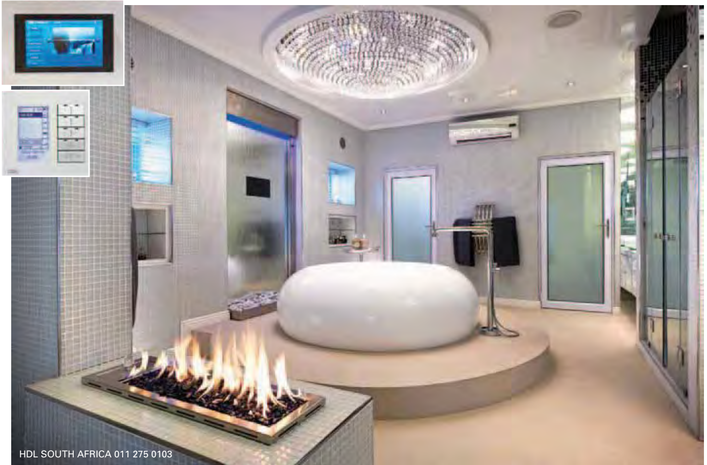
HDL SOUTH AFRICA 011 275 0103